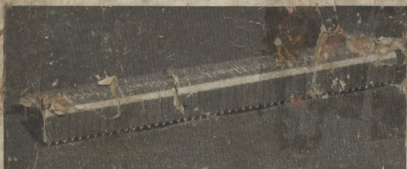
USE No. 18 STAPLES IN THIS MACHINE

TO OPERATE: —Adjust gauge by thumb-screw to obtain distance desired from staple to edge of paper or cloth. Press lever firmly all the way, and remove work. See that lever is allowed to return to original position before driving another staple.